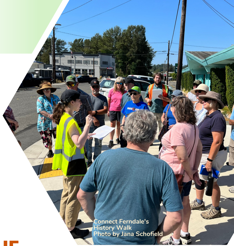
Connect Ferndale's History Walk